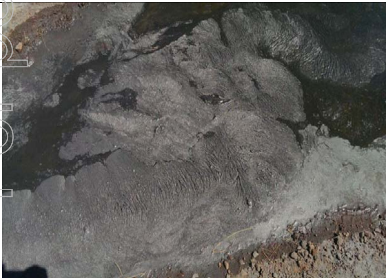
Figure 2: Abundant flake graphite in RC drill hole sump – Target 6, McIntosh Graphite Project.

RC drilling has also been completed at Target 5. RC drilling has confirmed downhole intercepts varying from 10m to 122m over a strike length of 1,000m (refer Table 2, Appendix). Multiple flake graphite intercepts are present in a number of drill holes.